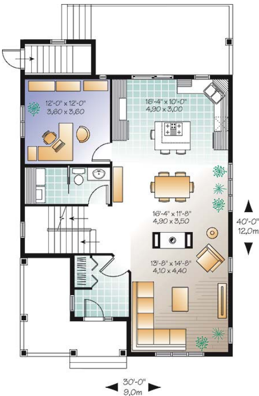
Main Floor Layout – Approx 1100 sqft