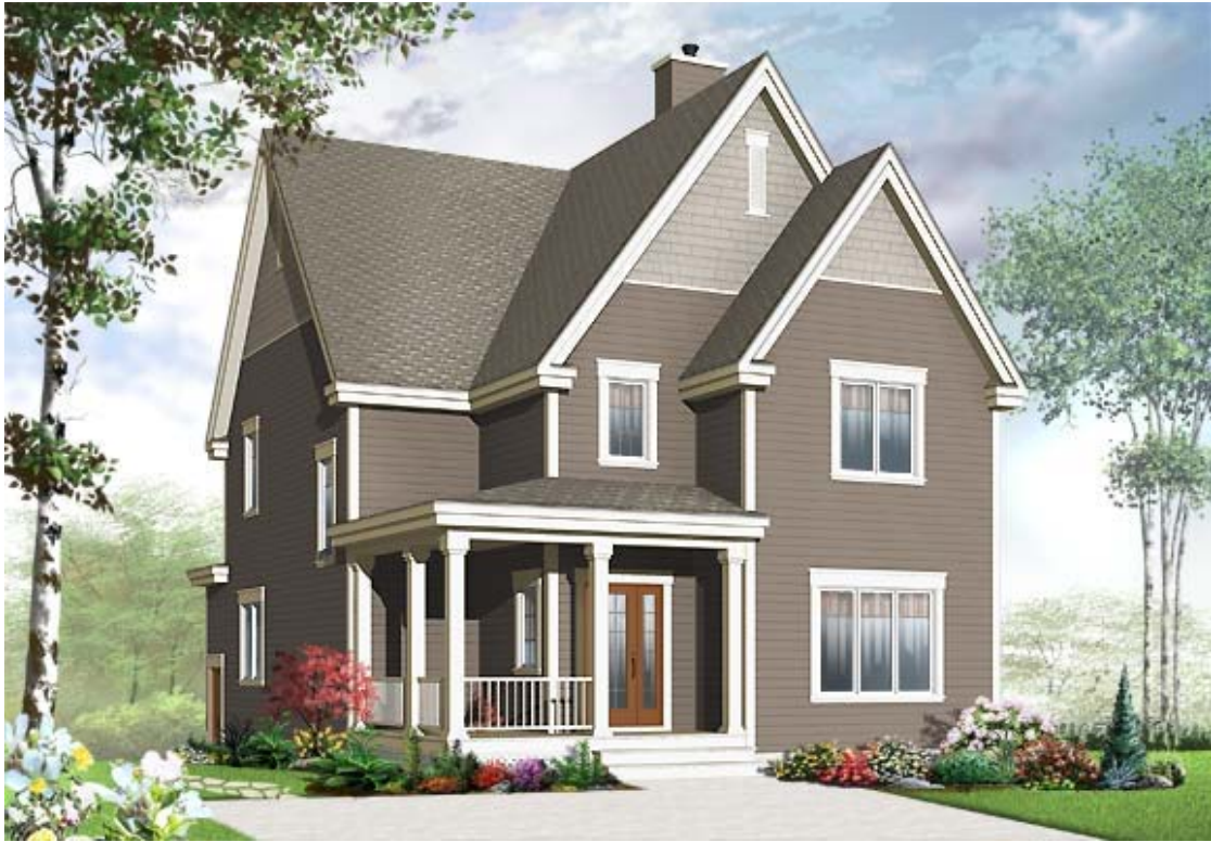
Conceptual Rendering of Proposed Home Elevation (actual may be different to comply with local bylaws, building codes, constructability & budgeted construction costs)