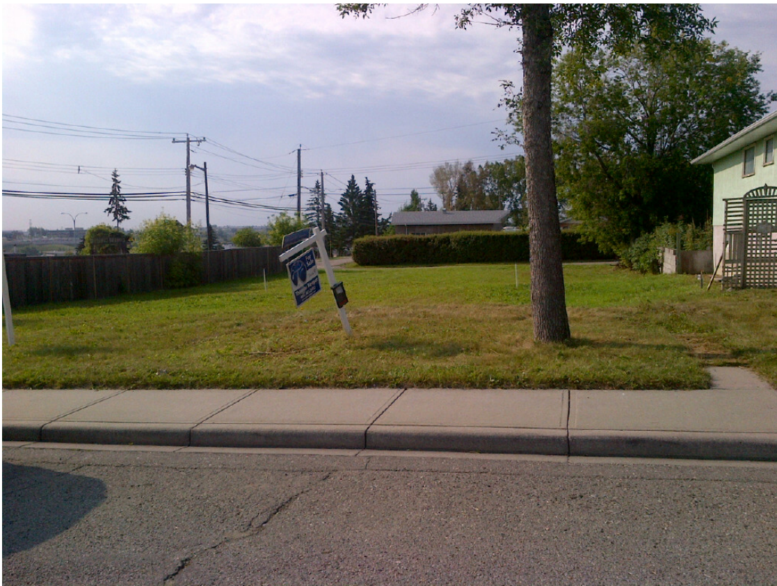
Development Site: 23 – 31 Ave SW

Presentation Objective: Request community and neighbours' support for the proposed project.