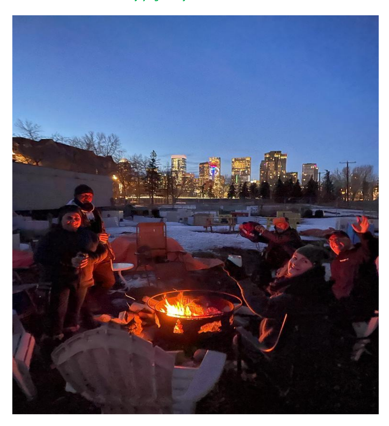
Erlton residents enjoying a bonfire at the Garden on March 31 2023.

ECA general meeting will be held on Tuesday, May 16 at 7:00 PM in the River Room at MNP Center.