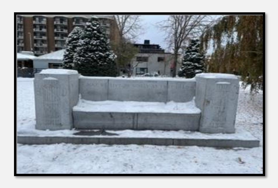
"MAY WE LIVE AS NOBLY AS THEY DIED" - South Bench