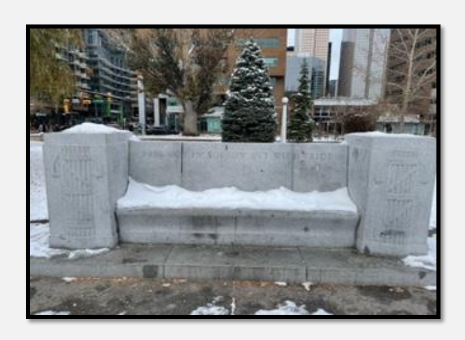
"PASS NOT IN SORROW BUT WITH PRIDE" - North Bench

Calgary Highlanders Annual Unit Parade and Ceremony of Remembrance – Nov.11<sup>th</sup> at 11:00 am Central Memorial Park at the Cenotaph.