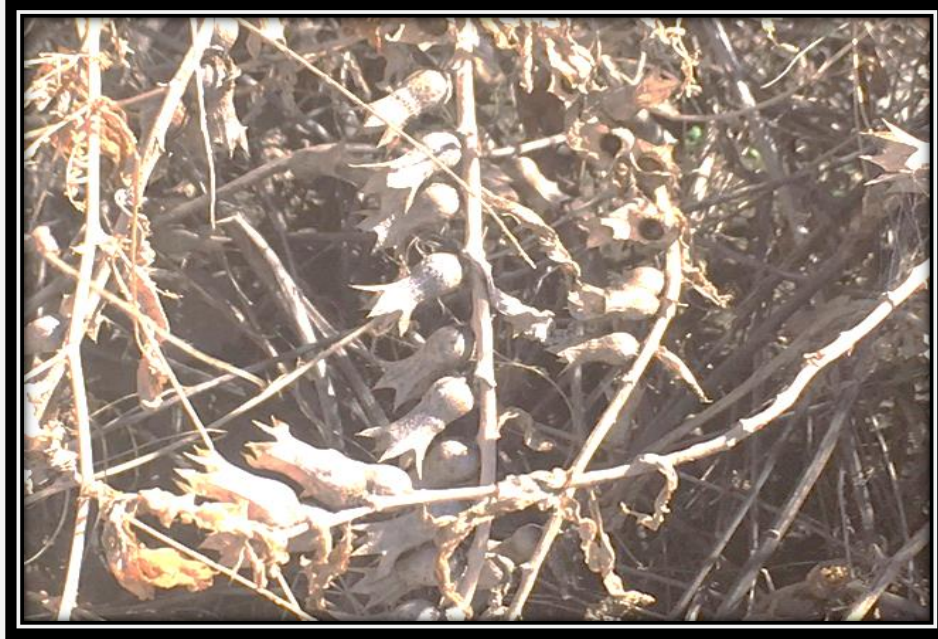
Dry Black Henbane in Erlton