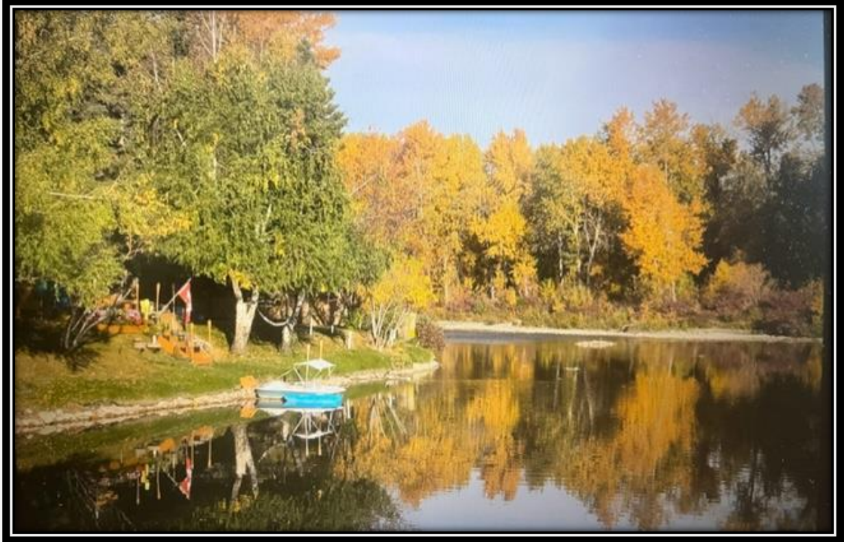
Elbow River