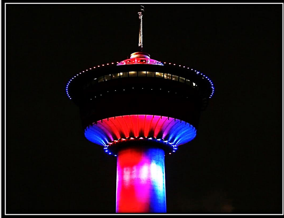
Crowchild Classic Annual U of C Dinos (Red) vs Mount Royal Cougars (Blue) Mens and Womens Hockey Games – Scotiabank Saddledome on Jan.24 th .