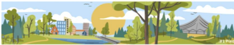
Option #1 “Pixar”

The theme is: “Bring beauty, joy, whimsy, and hope. Art doesn’t have to be political or serious. Introduce whimsy, surprise, and joy to your community.”