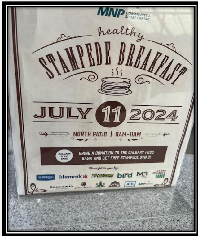
MNP Healthy Stampede Breakfast