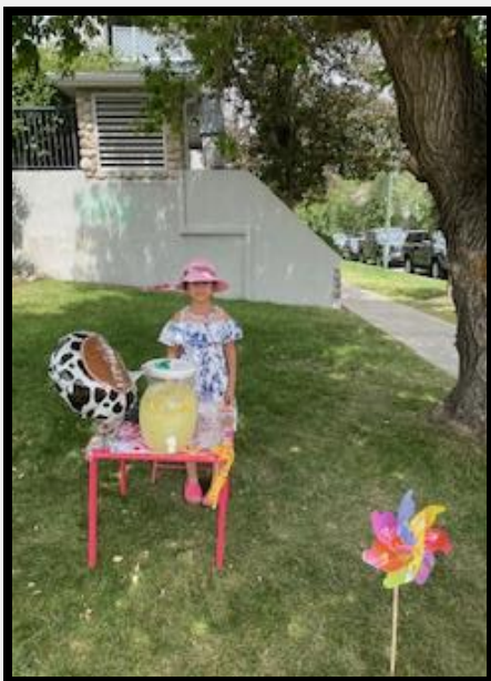
Weekend Side Hustle