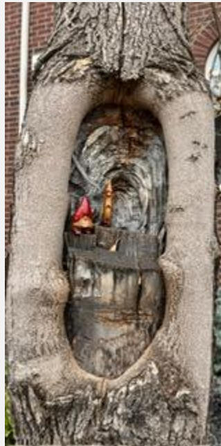
Tree Trunk

The communities of Eriton and Rideau-Roxboro, with the City of Calgary and MNP Sports Centre, are cleaning up the pathways and riverbanks through our communities, followed by a family barbecue in Lindsay Park. Volunteers eat free!